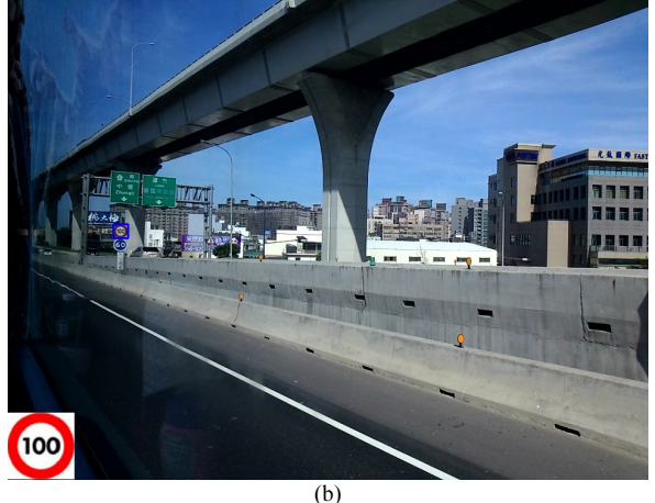
Fig. 2 Experimental results obtained from the highway.

with a 1.6GHz ARM Cortex-A9 Quad-Core CPU (Radxa Rock Pro [10]). An Android application program was developed to test the proposed method on android platforms. In the experiments, the image size is set to 640-by-480 pixels. The Android embedded implementation had been tested the system on the highway to evaluate the robustness and real-time performance of the proposed method. Figure 2 shows the experimental results obtained from the highway. It is clear that the proposed method successfully detect and recognize the SLS in real-time.